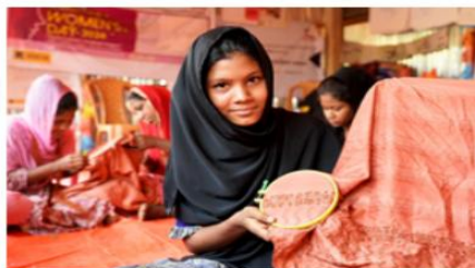
Figure 1. ERD Participant showcasing skills development in Host community programming

International Women's Day 2026: Marked through rallies, cultural and interactive activities engaging 1,656 participants (554M, 1,102F) across field, national, and global platforms, promoting awareness on women's rights, gender equality, and collective action to prevent GBV.