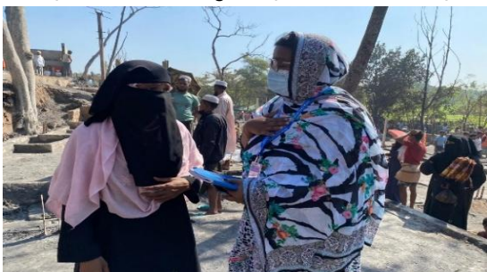
Figure 02: Compassion in action: staff providing Psychological First Aid (PFA)

Following the fire incident in January 2026 that affected around 500 families in Camp 16 (Block D), CARE Bangladesh provided immediate life-saving protection support. Care Supported approximately 734 individuals during the Emergency response, including the provision of temporary shelter at WGSS for 19 vulnerable women, ensuring their safety, dignity, and