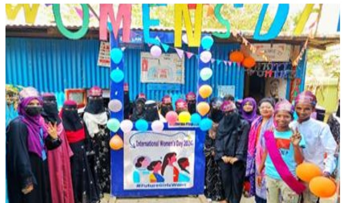
Figure 2: Project participants are in festive celebration of