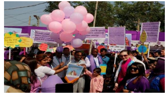
Pic 3: IWD 2026 inauguration ceremony in Camp 18

On March 8, 2026, the GBVSS in collaboration with the Gender in Humanitarian Actor (GiHA) Working Group commenced the International Women's Day (IWD) 2026 with the theme of "Rights. Justice. Action. For ALL Women and Girls". It was attended by a distinguished assembly of stakeholders, reflecting a unified humanitarian commitment to gender equality in the Rohingya response, celebrating progress in gender equality and committing to a more inclusive society. A significant number of various UN agencies and the Rohingya Coordination Platform (RCP) were present, alongside delegates from International, National and Local NGOs graced the occasion.