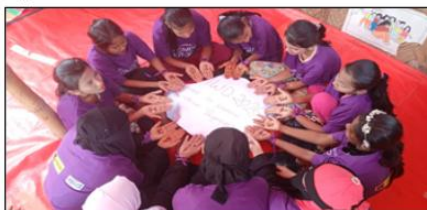
Figure 2: The adolescent girls Henna celebration day 2026 at Camp 22