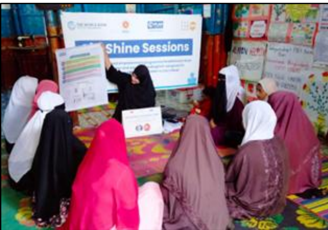
Figure 1: Session on Girl shine, discussing GBV, SRHR and gender equality issues with adolescent

From January–March 2026 Plan International Bangladesh, in partnership with UNFPA, implemented Champion of Change (CoC) and Girl Shine Life Skills Education sessions across 15 Rohingya camps and 5 host communities in Cox's Bazar, delivered through 57 youth-responsive facilities and 21 Women Friendly Spaces in collaboration with Mukti Cox's Bazar. The programme engaged adolescents and caregivers in discussions on gender equality, GBV prevention, SRHR, mental health, and positive parenting, contributing to safer and more supportive community environments, engaging adolescents and caregivers on gender equality, GBV prevention, SRHR, mental health, and positive parenting to promote safer and more supportive communities.