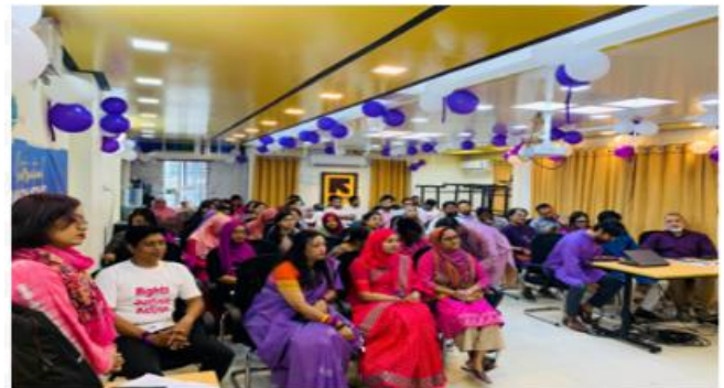
Figure 3: IRC Staff at IRC Ukhiya office attending the IWD awareness meeting