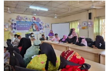
Figure 01: A dialogue session was held at Camp 16 between the CiC and women

International Women’s Day (IWD) 2026: International Women’s Day 2026 was implemented as a key strategic protection and advocacy initiative across Camps 11, 12, 15, 16, and host community, reaching an estimated 407 women, men, boys, and girls through community rallies, dialogue sessions, and awareness activities on gender equality, GBV prevention, and women’s leadership.