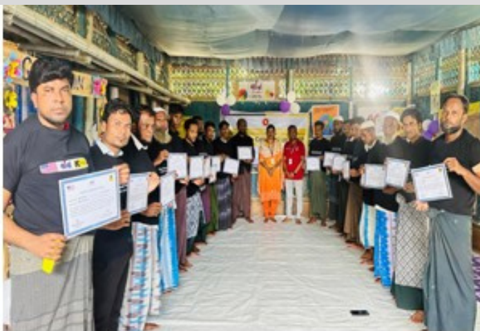
Certificate distribution to EMAP Graduate participants at camp-13