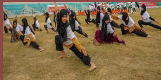
Martial Arts display at the event of 16 Days of Activism 2024