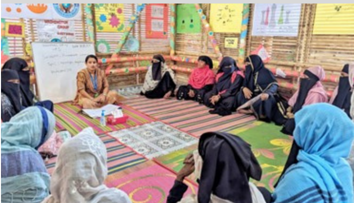
Awareness session with adult women at camp-9