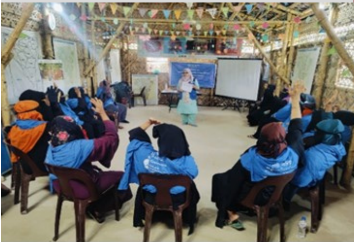
Training for WPP Members