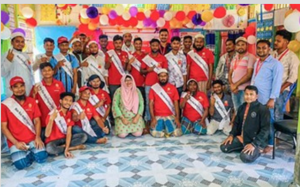
Men as community change maker