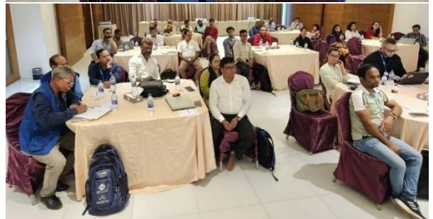
LSDS JRP 2025 preparation workshop for the partners