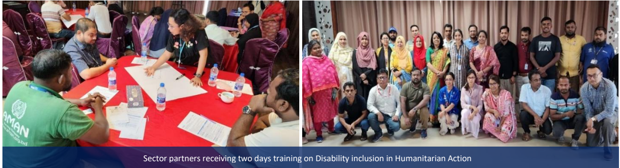
Sector partners receiving two days training on Disability inclusion in Humanitarian Action