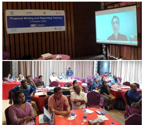
LSDS organized a one day proposal and reporting writing training for INGO and NNGO partners, ISCG reporting officer taking a session on reporting remotely.