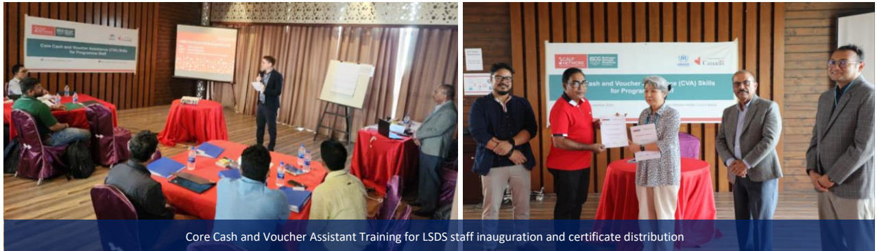
Core Cash and Voucher Assistant Training for LSDS staff inauguration and certificate distribution