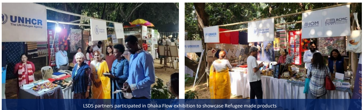
LSDS partners participated in Dhaka Flow exhibition to showcase Refugee made products