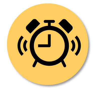
Sept 2023 to Nov 2025