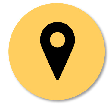
Local community Cox's Bazar Sadar (Ward 2, 3, 4, 5, 9, 10, 11, & 12) and Ramu (2 unions)