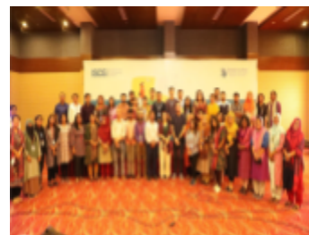
ToT on 'Saying No to Sexual Misconduct'