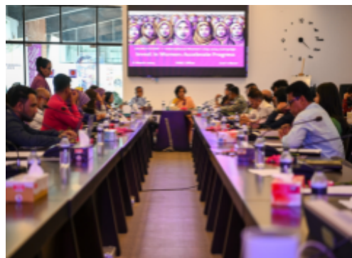
Picture: Participants of the session of the IWD 2024 launch event "Open Dialogue on Invest in Women"

In collaboration with UN Women and other actors, the GBVSS co-organized an open dialogue on "Investing in Women: Accelerate Progress" to commemorate International Women's Day 2024. The representatives from different UN and INGOs urged to invest more in women and girls while agreeing to that in respective programmes.