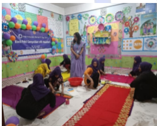
Figure: Celebrating International Women's Day 2024 with a block print competition in Ratnapalong WFS.