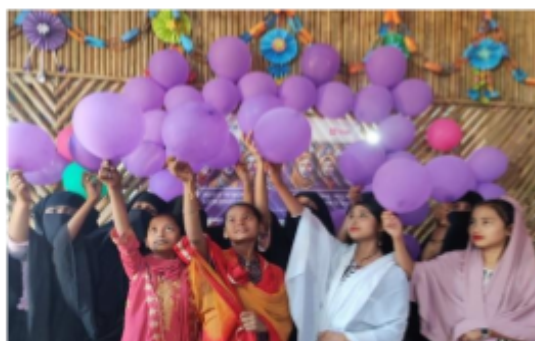
Figure: Girls are celebrating International Women's Day in Kutpalong RC.