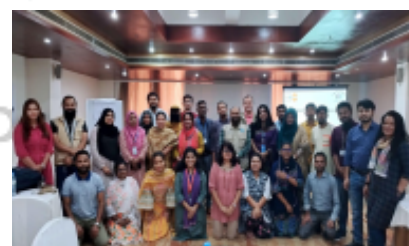
Figure: Participants with facilitators of Men and Boys engagement training.