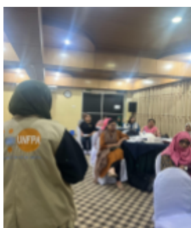
Picture: Facilitation during PSS and Supervision Workshop