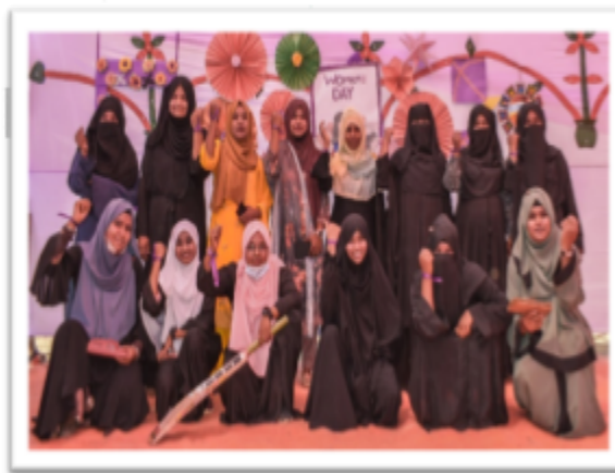
Figure: Cricket match played by the community volunteers to reflect their dedication to gender equality on Women's Day