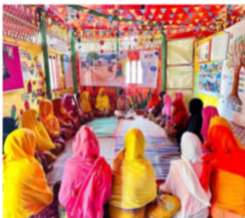
Figure: Session with SASA! Together Community activists.