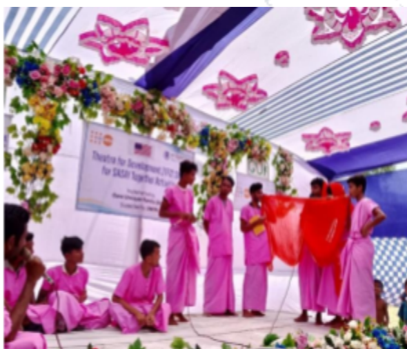
Figure: Drama Show at Camp 19, performed by community TFD group.