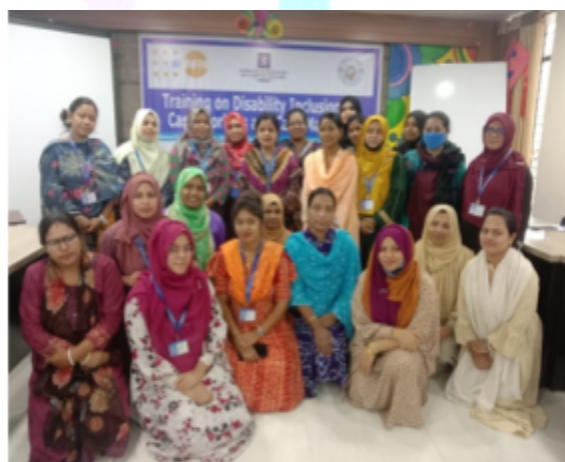
Figure: Training on Disability Inclusion