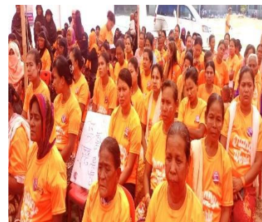
Women Gathering on Climate change and GBV: Celebrating 16 Days of Activism with Indegenous Women (Rakhaine Community) at Sagarmoni High School, Chowfaldandi, Cox’s Bazar on 28 November 2023