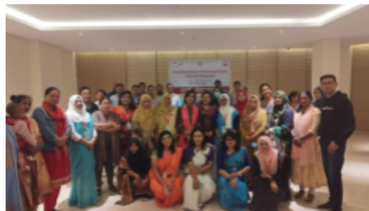
Training on GBV Core Concept with CARITAS BD