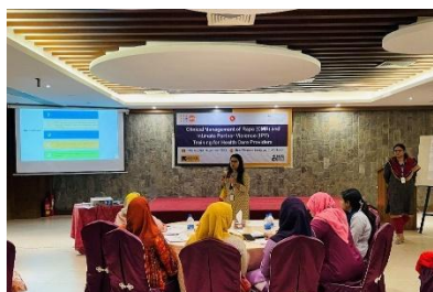
Training Session- CMR to staff members