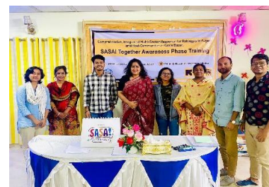
SASA TOGETHER! Awareness Phase training- Organized by Nari Maitree in November 2023