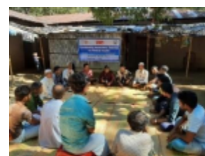
MCRT conducting MHPSS awareness session

UNFPA Pilot: Mobile Community Response Team (MCRT) → UNFPA is piloting community-based mental health services through the MCRT. This team conducts workshops addressing mental health issues, reaching 10,357 community members, including host and Rohingya communities. Topics covered include mental health discussions, stress management, and more.