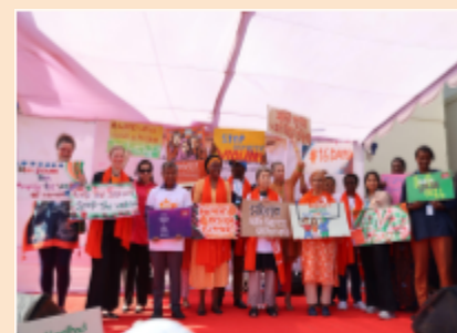
Uniting Voices to End Violence towards Women and Girls: Launching of 16 Days of Activism

The GBVSS, in collaboration with 67 partners, including UN agencies, NGOs, and government stakeholders, inaugurated the 16 Days of Activism against Gender-Based Violence on November 23, 2023, through a two-day event. The occasion featured art activities advocating against GBV, followed by a fair and cultural program. Additionally, over 800 camp-level events organized by GBVSS members, impacting tens of thousands of individuals across various demographics. The UNiTE campaign spotlighted "Invest to Prevent Violence Against Women & Girls," highlighting strategic actions beyond mere financial commitments. These collective endeavors have been documented in the 16 Days of Activism Advocacy Report 1