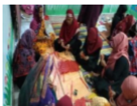
Women discovering their skill through empowerment training