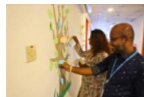
Cultivating gratitude: Focusing on self and others

UNFPA's Commitment to Staff Well-Being → At UNFPA, staff well-being is a top priority, and knowledge sharing is integral to delivering quality services. The organization honors events like Suicide Prevention Day and World Mental Health within its premises, fostering awareness among staff. This initiative encourages open dialogue, enabling team members to support each other and cultivate a workplace culture that prioritizes mental health.