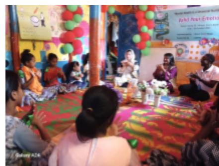
World Mental Health day celebration at Camp 2E