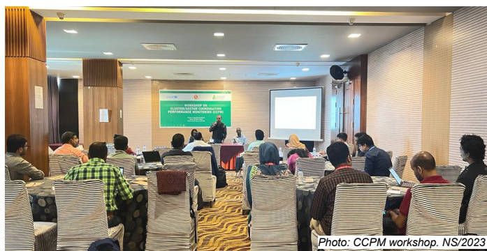
Photo: CCPM workshop.

Cluster/Sector Coordination Performance Monitoring (CCPM) workshop has been conducted on 30 November 2023. The purpose of CCPM is to identify areas for support and improvement, ensure that clusters/sectors are efficient and having effective coordination mechanisms, which fulfil the core cluster/sector functions, meet the needs of constituent members, and support delivery to affected people. It is also an effective way of demonstrating accountability and the added value of the cluster/sector and to justify the cost of coordination. A Cluster/Sector Coordination Performance Monitoring provides an in-depth assessment based on the perceptions of the partners and sector coordinator about the functioning of the cluster/sector in fulfilling its six specific core functions, which are: