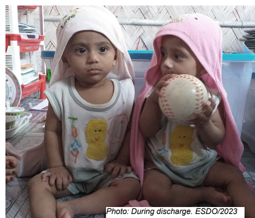
Photo: During discharge.