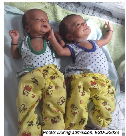
Photo: During admission.