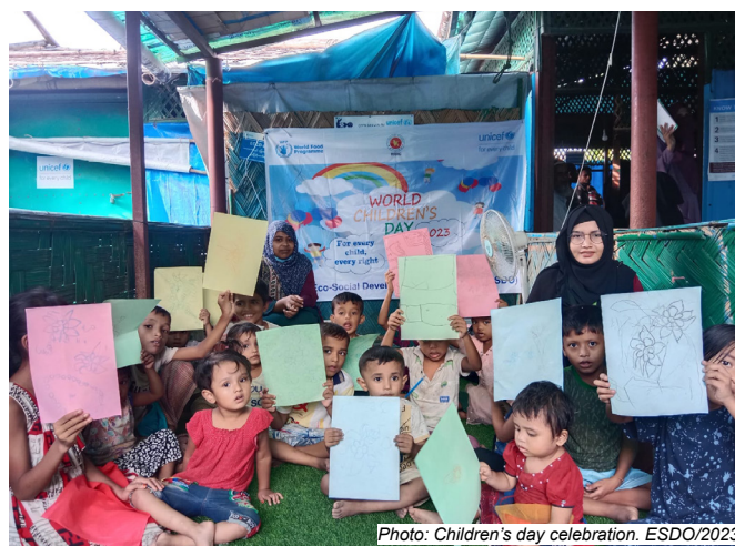
Photo: Children's day celebration.

World Children's Day is an annual global event dedicated to promoting and celebrating the rights of children. The theme of Children's Day for this year was "For every child, every right". This day was celebrated by a diverse range of activities, involving the decoration of the Integrated Nutrition Facility (INF) to promote this year's message among the vulnerable Forcefully Displaced Myanmar Nationals (FDMN)/Rohingya community. The day began with a burst of colours and creativity, as the Early Childhood Care and Development (ECCD) section was adorned with playful decorations symbolising the innocence and joy of childhood. Volunteers and staff worked tirelessly to create an inviting and cheerful atmosphere. A lively rally commenced in the early morning, with the participation of beneficiaries, staff, volunteers, and other CiC office staff. The procession marched its way through the community, carrying banners