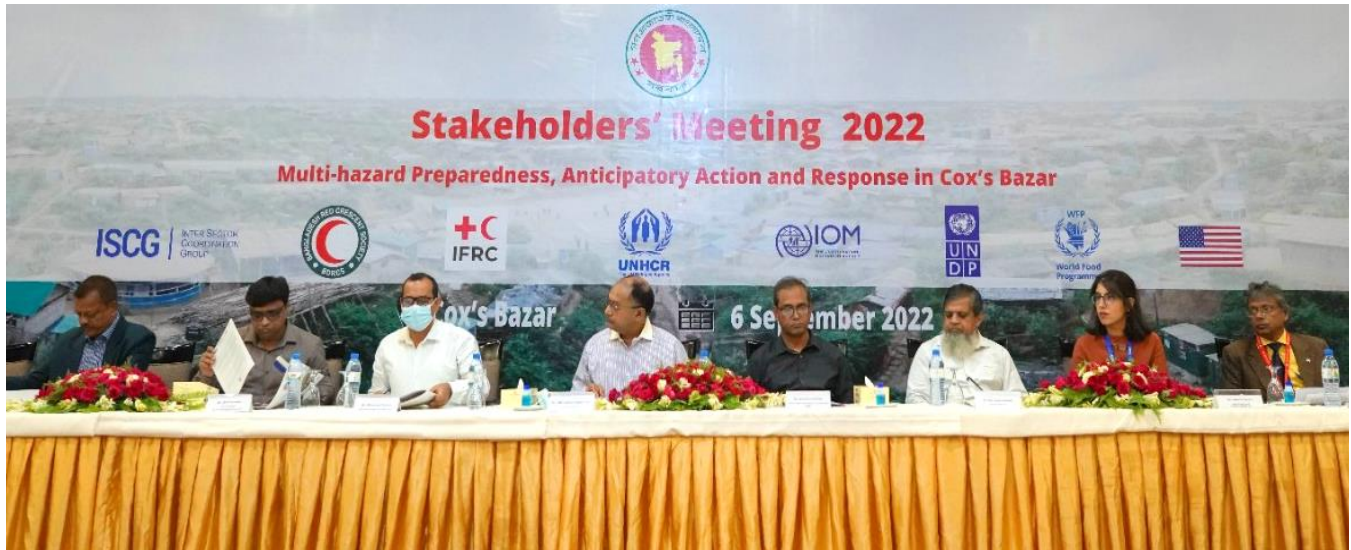
Photo 1: Stakeholders' Meeting 2022 focused on multi-hazard preparedness, anticipatory action and response happened on 6 th September 2022, presided by the Secretary of MoDMR

Cox's Bazar, one of the coastal districts of Bangladesh, is highly exposed to multi-hazards including high winds and storm surges of cyclonic storms making landfall on the Chattogram coast, monsoon rains, summer storms, and inclement weather caused by depressions in the Bay of Bengal. The camp settlements which are hosting more than 900,000 displaced Rohingya people from Rakhine state since 2017, has become vulnerable to soil erosions, landslides, and flashfloods especially during monsoon season due to hill-cutting, deforestation and interruption to natural setting. Torrential rainfall causes disruption of road access, shelter and asset losses, and additional barriers for refugees to access services.