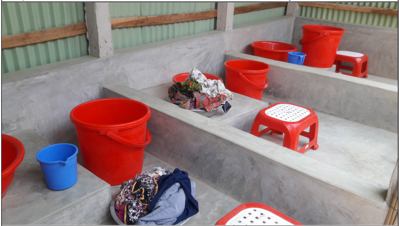
CARE Bangladesh has piloted a new laundry facility that provides private and fast drying for menstrual cloth.

As a result, CARE Bangladesh has adapted WASH facilities and guidance for WASH staff. They also piloted a new laundry facility that provides private and fast drying for menstrual cloth, with adequate ventilation and a screen to ensure the materials are not seen by others.